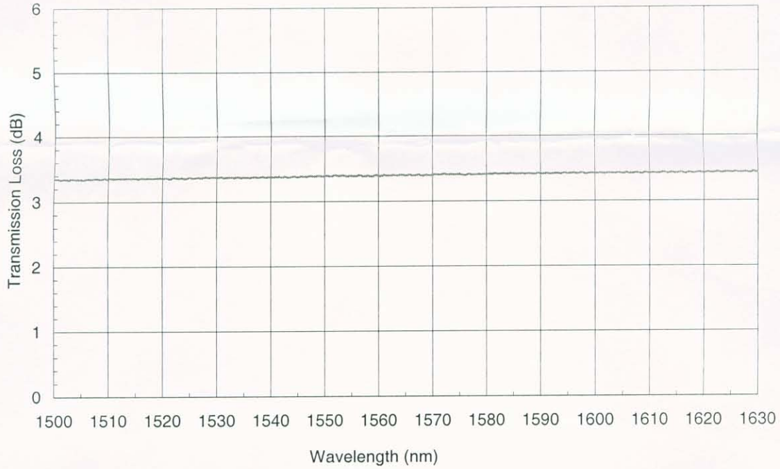
Transmission Spectrum @ 23°C