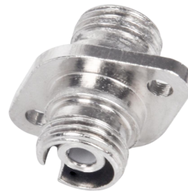
Senko FC (Oval Flange)