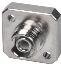
Senko FC (Square Flange)