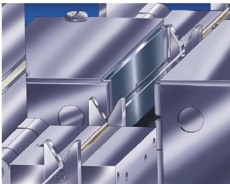
Automatic Recoat Mold